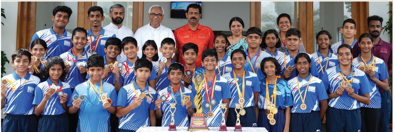
In the Visio 2024 Swimming Championship conducted by Chavara Darsan CMI Public School, Koonammavu on 24th August 2024, 25 students of our team won 18 Gold, 11 Silver and 13 Bronze medals. We got Overall Championship with 255 points.