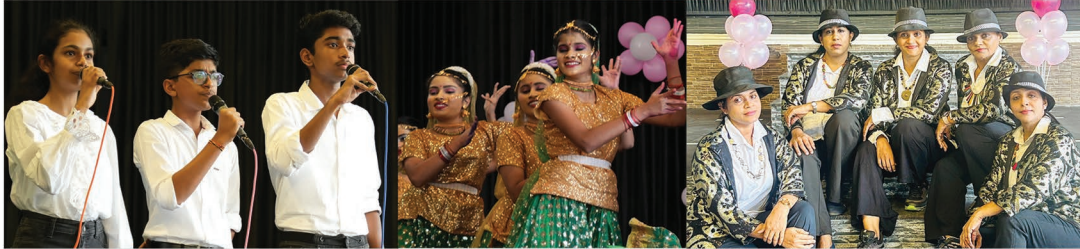
Leading with hearts and wisdom - Happy Feast Day dear fathers: The students put on a vibrant display of festivities to celebrate our Manager's B'day.