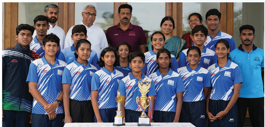
In the 16 th Ernakulam District Senior Swimming Championship held at M A College, Kothamangalam, 14 students participated from our School and won 9 Gold, 15 Silver and 11 Bronze medals. Our team won the WOMEN SECTION CHAMPIONSHIP and OVERALL RUNNERS-UP. Congratulations!