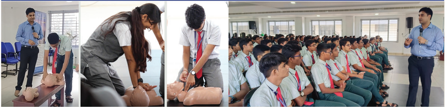
The Rotary club, in collaboration with the school PTA launched a First-Aid & Basic Life Support awareness programme for students of grades 10 &12.