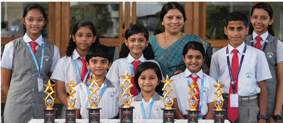
Viswajyothis is proud of all the winners of VISTA , an inter-school cultural competition hosted by Rajagiri Public School, Kalamassery.