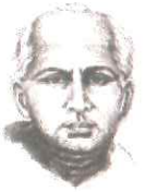
St. CHAVARA 1805-1871

Phone: Office: +91 484 2736600 Kindergarten: +91 484 2736611