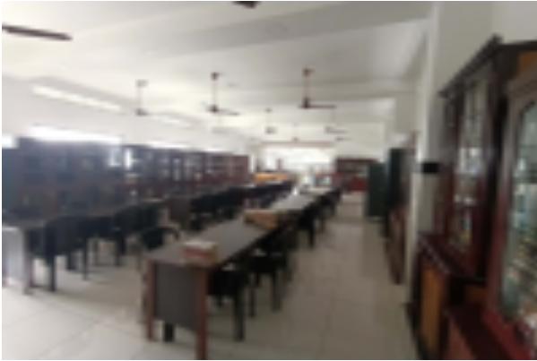
SCIENCE LAB PHOTO